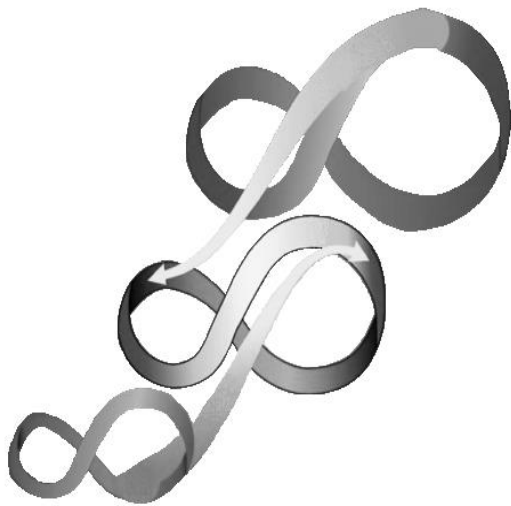
Figure 1: The Adaptive Cycle

(Gunderson and Holling, 2002). The growth phase ( r ) is characterised by: rapid accumulation of resources (capitals), competition, seizing of opportunities, rising level of diversity and connections, and high but decreasing, resilience. At conservation phase ( K ) growth slows down as resources are stored and used largely for system maintenance. This phase is characterised by: stability, certainty, reduced flexibility, and low resilience. The creative destruction phase ( \Omega ) is characterised by chaotic collapse and release of accumulated capital. This is a time of uncertainty when resilience is low but increasing. The reorganisation phase , ( \alpha ), is a time of innovation, restructuring and greatest uncertainty but with high resilience (Pendall et al. , 2010:76).