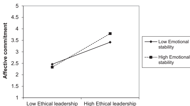
Figure 4. Moderation effect of emotional stability in the ethical leadership and affective commitment relation

Less significant findings were observed by controlling study results for demographic factors. It turned out that the control variables did not significantly contribute to the clarification of variance in job satisfaction ( R^2 = 0.035, p = 0.100 ), affective commitment ( R^2 = 0.025, p = 0.313 ) or burnout ( R^2 = 0.019, p = 0.517 ). The explanation of variance increased significantly only with the addition of ethical leadership. This means that the control variables did not significantly influence the research question of how ethical leadership affects job satisfaction, affective commitment and burnout. It could be shown only that the control variables alone significantly explain 4.2% ( p = 0.043 ) of the variance in emotional stability and 4.5% ( p = 0.026 ) of the variance in frustration tolerance, which represents a very small effect size. As shown in Table 3 , hardly any significant results could be found by examining moderating relationships. It turned out only that affective commitment significantly increased with the length of employment in the moderating relationships. Aside from these results, the study showed that physicians rated their supervisors' ethical leadership significantly lower than did other health professionals ( \beta = -0.170, p = 0.001 ).