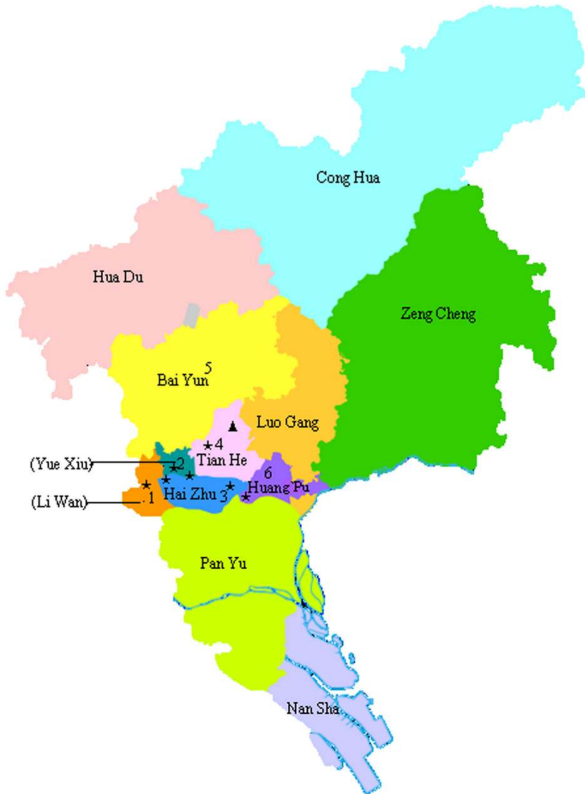
Figure 1. A map of Guangzhou showing the location of Guangzhou weather station (marked by triangles) and seven air pollution monitoring stations (marked by a star). The six urban districts included in the present study are labeled by number 1-6.