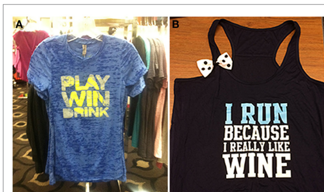
FIGURE 1 | The celebration motive (A) and body image motive (B) are illustrated by these items of clothing.

interesting because an athletic victory may be the occasion that spurs the drinking, as has been shown in college athletes (61, 62) (see Figure 1 ).