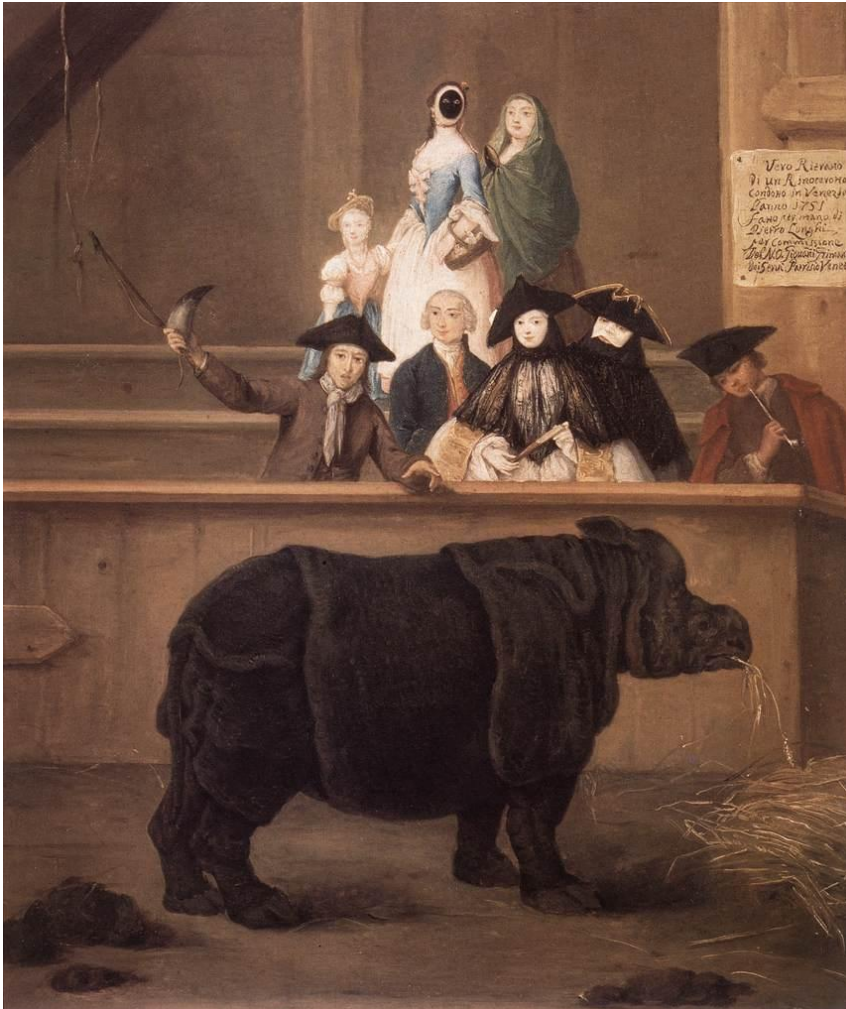
1 Pietro Longhi, Exhibition of a Rhinoceros, 1751, oil on canvas, 24 in. x 18.5 in. Ca' Rezzonico, Venice