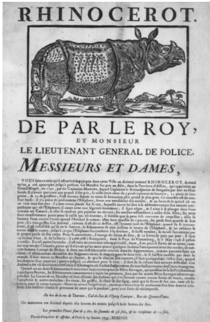
3 Rhinocerot, 1749, woodcut on paper, 9.2 in. x 13.6 in. Paris, Private collection