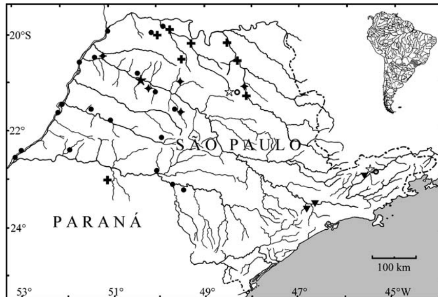
Figure 2. Map with the distribution of the exotic decapod species recorded in the states of São Paulo and Paraná, Brazil. Symbols (solid: occurrence in the wild; open: occurrence in aquaculture ponds): Procambarus clarkii = ▼, Macrobrachium amazonicum = ●, ○; Macrobrachium jelskii = ◆, ◇; Macrobrachium rosenbergii = ★, ☆; Dilocarcinus pagei = +. (Some symbols may represent more than one locality.)

Five exotic decapod species are reported in natural environments in the hydrographic basins of the state of São Paulo (Figure 2), and their occurrence could be related to different causes. The crayfish Procambarus clarkii has a worldwide dispersion and Hobbs III et al. (1989) mentioned that introductions of P. clarkii in Latin America were probably aiming at commercial aquaculture