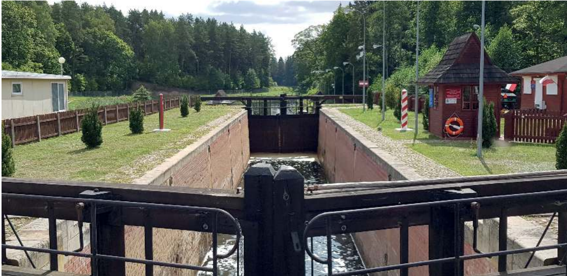
Fig. 1. Kurzyniec Lock as a border crossing. The border between Poland and Belarus runs along the axis of the Lock, and further along the Canal for some 3.5 km

mostly in a position to cultivate their own traditions [30]. The Augustów Canal is regarded as a historic monument [34]. The land along it has highly valuable natural features, given the resources of both water and forest, as well as the inclusion of two transboundary areas, i.e. the Bug Euroregion and the transboundary functional sub-region of the Augustów Forest and Augustów-Grodno [12, 16, 35].