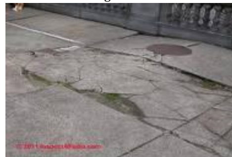
Figure 1. Crack pattern of expansive soil.

the field, expansive clay soils can be easily recognized in the dry season by the deep cracks, in roughly polygonal patterns, in the ground surface as shown in figure 1.