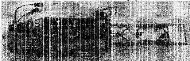
Figure 2. One of 2 WS/HS actuator assemblies per WS/HS station, these profile measurements detect the profile out to 10^5:1 in dynamic range.

Throughout the halo lattice there are specific beam instruments that acquire horizontally and vertically projected particle-density distributions out to greater than 10^5:1 dynamic range. We measure the core of the distributions using traditional wire scanners, and the tails of the distribution using water-cooled graphite scraping devices. The wire scanner and halo scrapers (see fig. 2) are mounted on the same moving frame whose location is controlled with stepper motors. A sequence within the experimental physics and industrial control system (EPICS) software communicates with a National Instrument LabVIEW virtual instrument to control the motion and location of the scanner/scrapper assembly. Secondary electrons from the wire scanner 0.03-mm carbon wire and protons impinging on the scraper are both detected with a lossy-integrator electronic circuit. Algorithms implemented within EPICS and in Research Systems Interactive Data Language subroutines analyze and plot the acquired distributions. This paper describes this beam profile instrument, describes our experience with its operation, compares acquired profile data with simulation, and refers to other detailed papers.