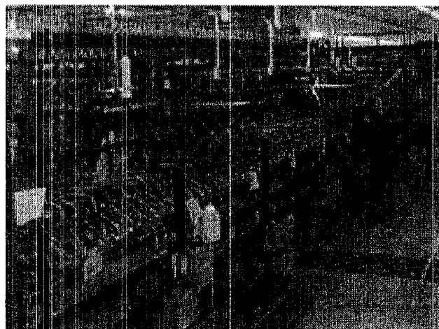
Figure 1. Shown above are the initial 8 quadrupole magnets, 2 steering magnets, and the initial beam diagnostic instruments in the quadrupole-magnet lattice.

Table 1 shows the locations of various beam diagnostic components and steering dipole magnets as defined by the space downstream of the numbered quadrupole magnet. The WS/HS assemblies measure projected beam distributions in both horizontal and vertical planes at 9 locations within the lattice. The first WS/HS located at quadrupole magnet #4 is used to verify the RFQ-output-beam distribution. The two sets of four WS/HS provide beam matching and rms beam emittance information in the middle and end of the transport lattice. The set of four WS/HS assemblies located between magnets 20 and 26 measure the beam's match condition after the beam has sufficiently debunched to reduce any longitudinal space charge issues. The set of four WS/HS assemblies located between magnets 45 and 51 provide sufficient mismatch information to detect two possible mismatch modes, the quadrupole and "breathing" modes.