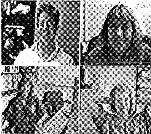
Figure 1. Video image of a CAVECAT meeting.

workstation. Personal workstations in each office send messages via Ethernet to the IIF server requesting connections. The IIF Server also examines privacy settings for each office to determine if requested access by another office is permissible.