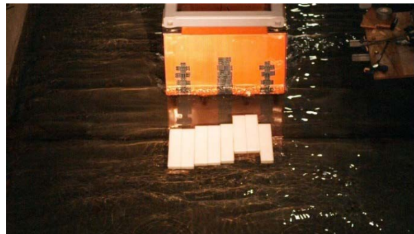
Figure 3 - Test specimen of an elevated coastal structure during the experiments in the Large Wave Flume at OSU.