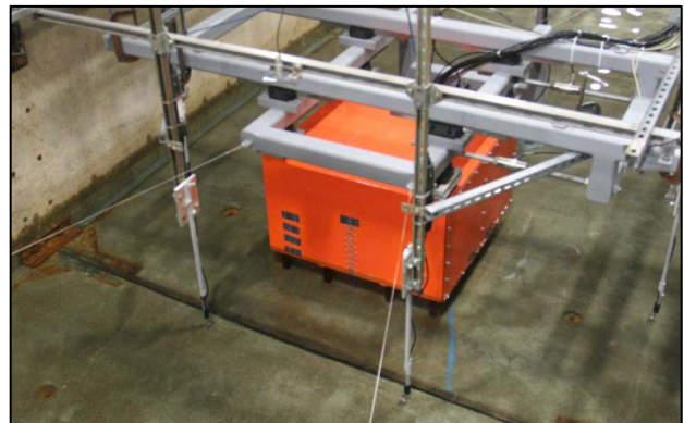
Figure 1 - Test specimen of an elevated coastal structure during the experiments in the Large Wave Flume at OSU.

Large-scale experiments in Oregon State University's Large Wave Flume (LWF) collected benchmark data to measure surface elevation (wave heights), pressures, loads, and 3D velocities for regular, irregular, solitary, and transient waves. The flume measures 104 m long, 3.66 m wide, and 4.6 m deep, with adjustable bathymetry. The piston-type wave maker assembly can generate regular, irregular, and tsunami-type waves and is equipped with active wave absorption system for large reflected waves. The test specimen consisted on a rigid steel box (1 m x 1 m x 0.6 m) supported by a frame (Figure 1) and fully instrumented with axial load cells, multi-axial accelerometers, and pressure transducers.