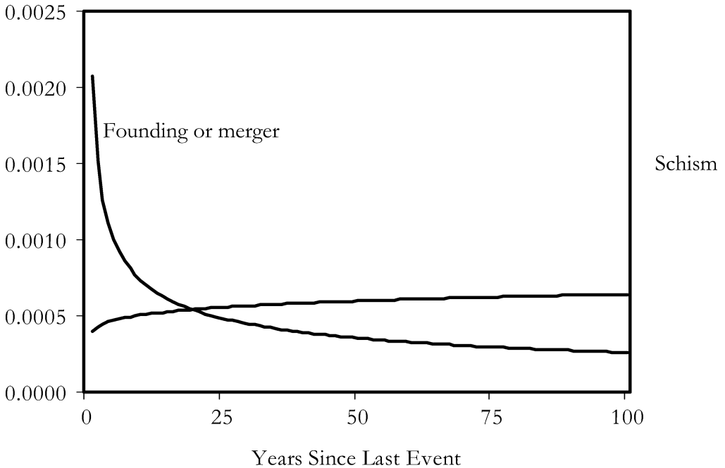
FIGURE 3 EFFECTS OF TIME SINCE MOST RECENT EVENT ON RATES OF SCHISM

powerful but short-lived “liability of consolidation,” and on the other hand to a mild immunization effect of past schisms.