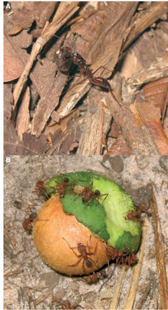
FIGURE 1. An illustration of how ant foraging guild and diaspore size may influence ant–diaspore interactions in the cerrado. (A) Worker of carnivorous Odontomachus chelifer (size ca 1.8 cm) transporting a diaspore of Xylopia aromatica (0.06 g) (Annonaceae) on the leaf litter of cerrado. These large ponerine ants regularly carry diaspores to the nest, where workers and larvae consume the fleshy portion, and the seeds are discarded unharmed. (B) Workers of fungivorous Acromyrmex coronatus (size ca 0.5 cm) collecting liquids and removing the fleshy portion of a Calophyllum brasiliense (Clusiaceae) fruit on the floor of a gallery forest in Brazil. Such large seeds (> 1 g) are not removed, but pieces of fleshy portion are sequentially transported by attine ants that use the material for fungus culturing inside the nest.

STUDY SITE. —The cerrado occupies more than 2 million km 2 , which makes it South America’s second largest biome (Oliveira-Filho & Ratter 2002). The study was carried out in the cerrado reserve of Itirapina (22°12’ S, 47°51’ W; altitude 730 m asl), southeast Brazil. Average annual rainfall is 1360 mm, concentrated mostly in the warm/wet season (October–March). A dry/cold season occurs from April to September. Mean annual temperature is 21.8°C (data from 1994 to 2004 from the reserve’s