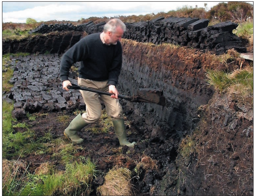
Figure 5. Traditional peat cutting in Scotland. This kind of relatively low-impact exploitation of peatlands may increase biodiversity by recreating transitional habitats.

In countries such as Switzerland, where the total surface area of remaining peatlands is small, several rare or endangered species now benefit from secondary habitats created by former peat extraction activities. These include the peat mosses Sphagnum affine , Sphagnum contortum , Sphagnum fimbriatum , Sphagnum teres , and Sphagnum warnstorffii , which are restricted to fens or often found in secondary bog vegetation (Feldmeyer-Christe et al. 2001), as well as dragonfly species such as Leucorrhinia pectoralis , Aeshna subarctica , Lestes virens vestalis , and Coenagrion hastulatum . The latter are found in the transitional habitats that often develop in peat extraction ditches (eg Sphagno-Utricularion , Caricion lasiocarpae , or Magnocaricion plant communities), but are absent from the late-succession stages of bog development (Delarze et al. 1998). In Sweden, it was found that the regional diversity of peat mosses had been increased in old hand-cut pits after spon-