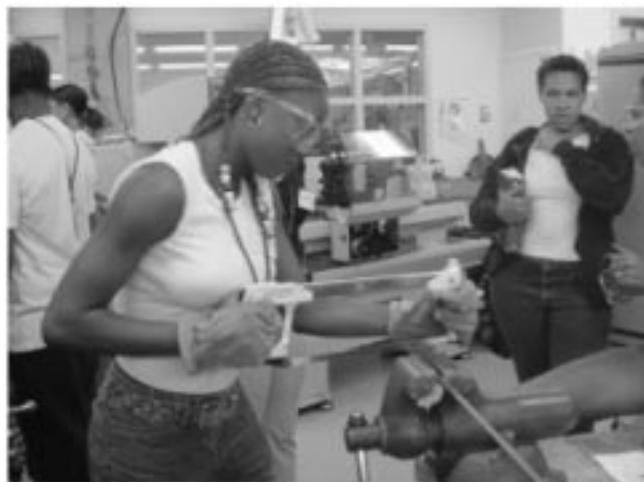
Fig. 6. Students work in the Manufacturing Center to create their stereo speaker team project.

It always works on paper! This is one of the main reasons why hands-on design, as opposed to abstract theoretical design, is critical to gaining an