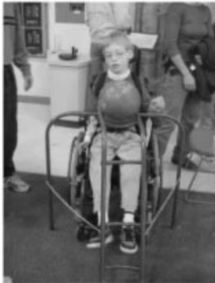
Fig. 3. A child with cerebral palsy tries out a bowling ramp created for him in an assistive technology section of the First-Year Engineering Projects course.

departure from engineering, including lack of early exposure to both hands-on learning environments and the ‘real world’ of engineering, coupled with limited cultivation of personal relationships with instructors due to large class size.