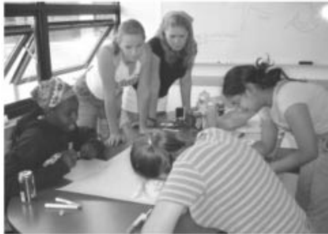
Fig. 5. High-school girls design the storyboard for their interactive multimedia presentation.

Reflecting input from the local community, SI is not just a one-time workshop, but rather a graduated series of summer opportunities for students in each of their high-school years. Open-ended design challenges pervade the curriculum for 11th- and 12th-grade students, following introductions to technology and a wide range of engineering fields in 9th and 10th grades. In a recent summer, students were challenged to design and build stereo speakers from scratch (Fig. 6). As the teens learned content theory and delved into their design/build project, they were concurrently engaged in team-building and creative-thinking activities. Hands-on engineering skills were developed, as they used digital cameras and color scanners and participated in soldering, hand tools, machining and software mini-workshops.