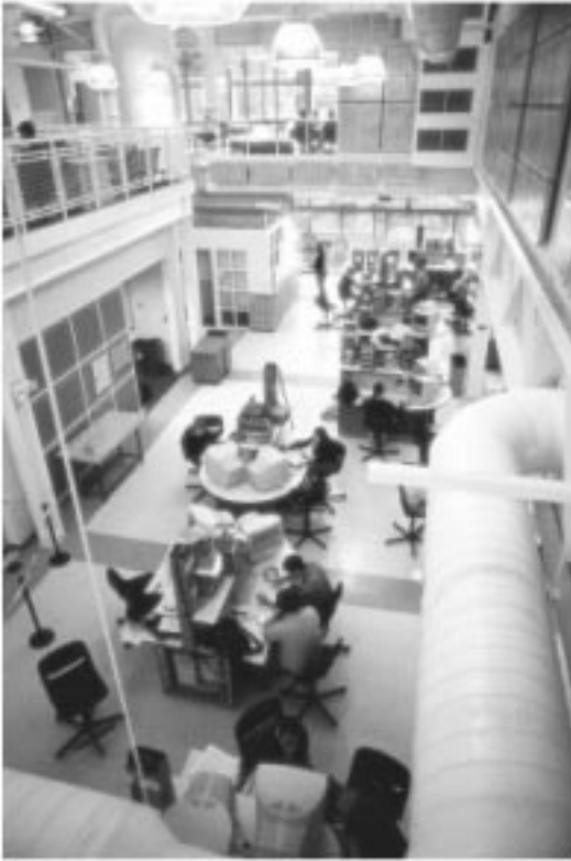
Fig. 1. One of two hands-on laboratory plazas in the ITL laboratory.

this desire with a First-Year Engineering Projects course as a counterpoint to the large, impersonal lecture classes in core mathematics and science classes [3]. In this one-semester course, which is required of some, but not all, engineering majors, students work in teams to design, build and test functioning prototypes, while honing valuable oral and written communication skills. About 14 sections serve more than 400 students annually.