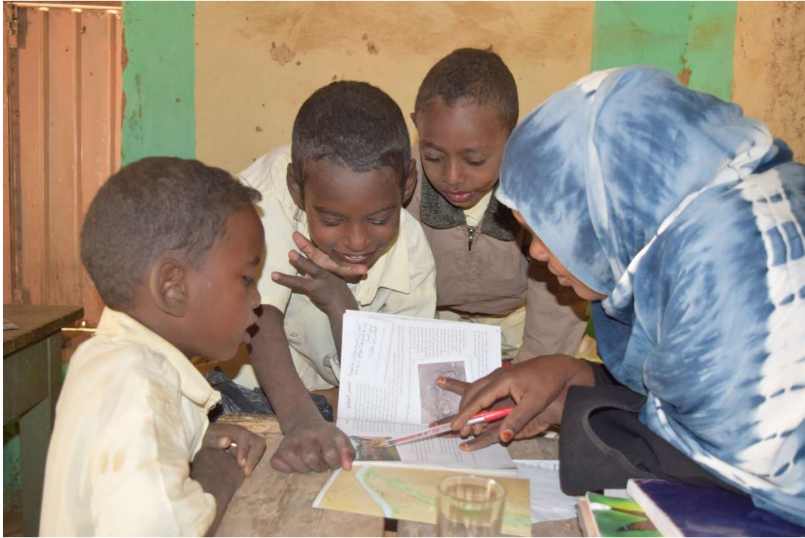
Figure 1 A teacher and pupils at Kalasaikal Bahri School studying a picture of al-Hilla fortress in the Mograt book.