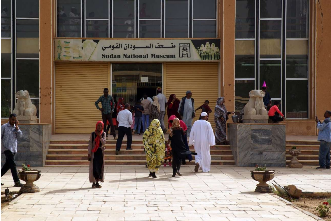
Figure 5. The Sudan National Museum on Independence Day, 1 January 2018.