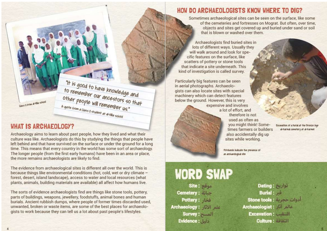
Figure 3. A page from the Mograt book with a word swap box, a quote and a photograph of children from a Class 3 who played a part in developing the book. Source: Tully and Näser, 2016: 4–5.