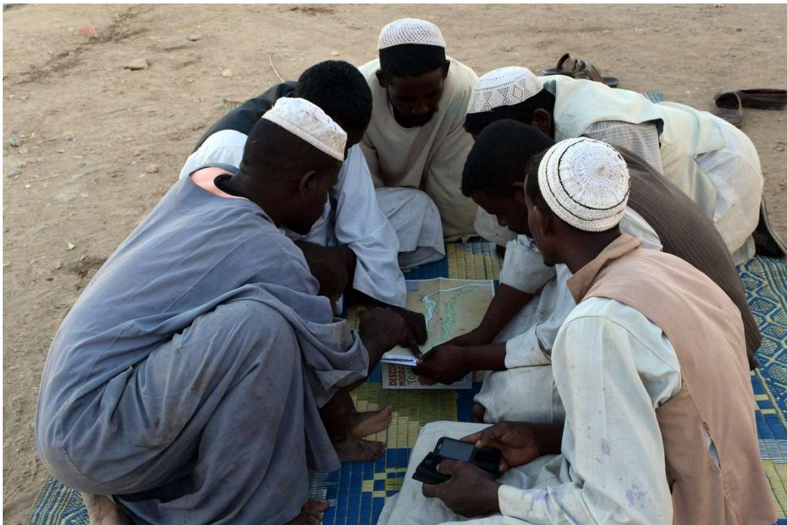
Figure 2 Residents of Mikaisir discussing the map of Mograt.