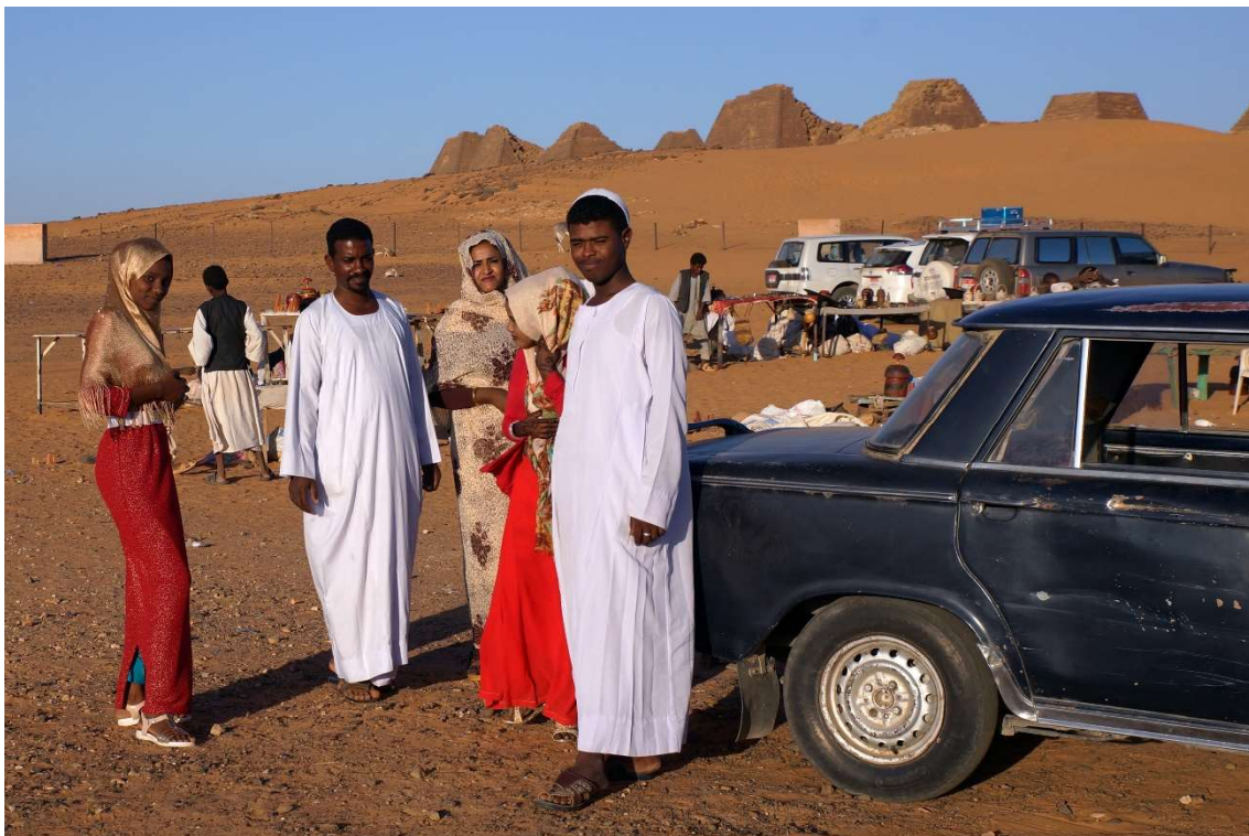
Figure 4. A family visiting the Royal Cemetery at Meroe, 29 December 2017.