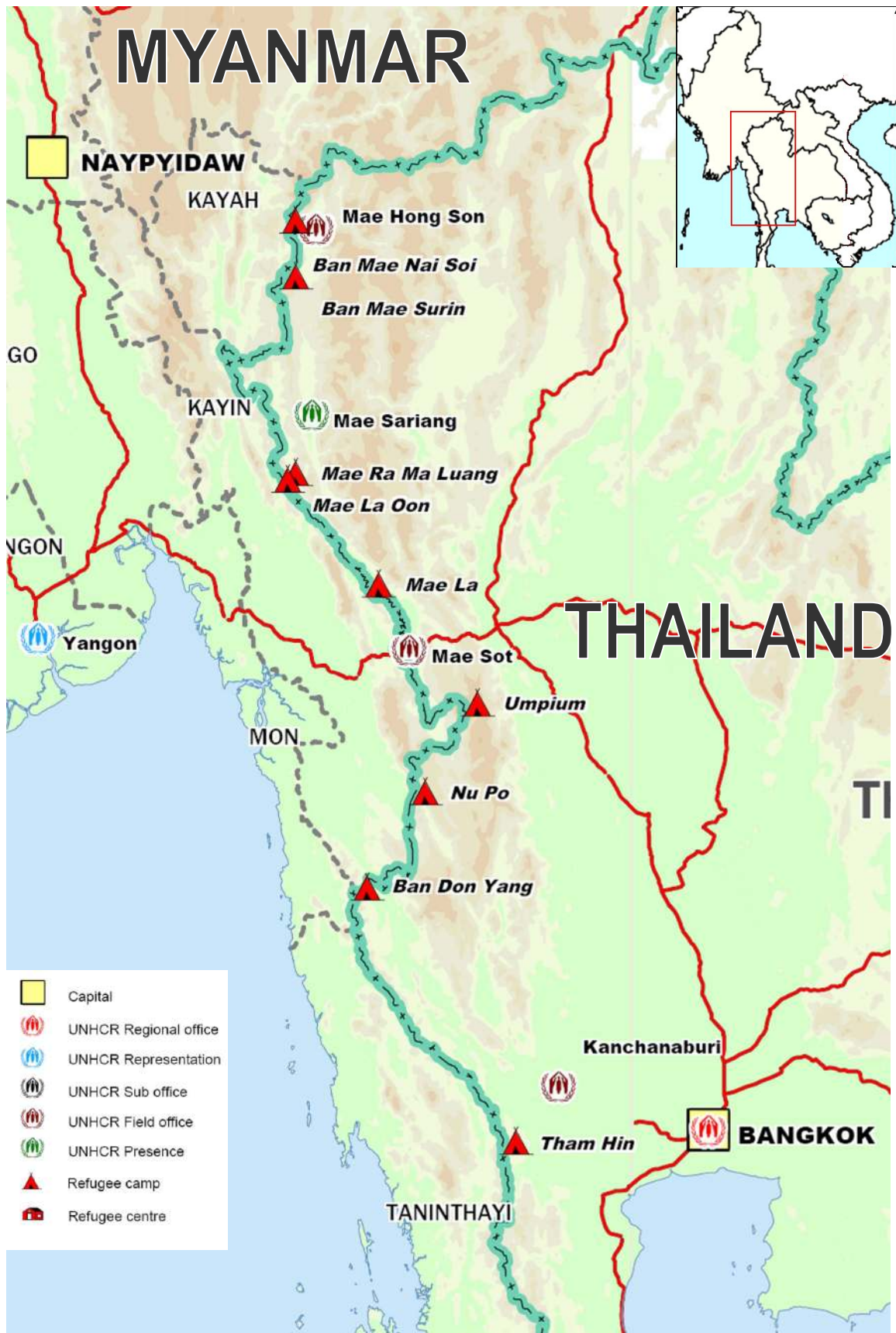
Map 1: Thai-Burmese Border with nine Refugee Camps