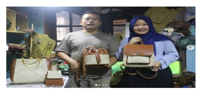
Figure 3. Entrepreneuship

Based on Figure 1, Figure 2, and Figure 3, it can be seen that the Menganyam Pesisir team carries out three programs based on social entrepreneurship. First, in the skill training program, the Menganyam Pesisir team guides women in processing pandanus, weaving, making accessories, and making products. Second, in the mentoring program, the Menganyam Pesisir team provides ongoing assistance and monitors the progress of the skills that have been carried out. Third, in the entrepreneurship program, the Menganyam Pesisir team shows the results of the crafts that have been produced. At this stage, the craft product is ready to be launched and ready to be sold.