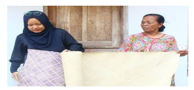
Figure 2 Mentoring