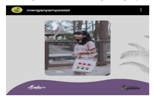
Figure 5. Bag Products

The two products above are the result of the production of the people of Gunung Kidul after receiving direction and training from the Menganyam Pesisir team. Products like this are marketed through social media, such as Instagram. Product photos uploaded on the Instagram page are supported by captions or descriptions of product sales, as follows.