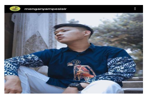
Figure 4. Batik products

In terms of marketing, Penganyam Pesisir has produced some products to be marketed, such as batik, jewelry, bags, woven mats, and so on.