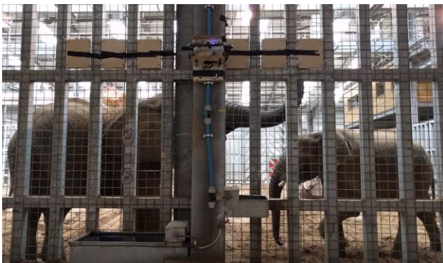
Figure 5: Elephants investigate radio buttons