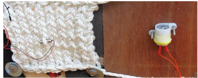
Figure 2: Vibromotors attached to back of button interface