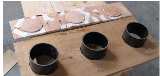
Figure 1: Early button prototypes