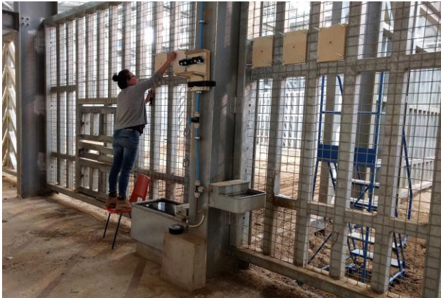
Figure 4: Mounting buttons on fence at Noah's Ark