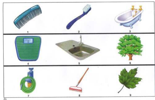
Fig. 1 Example trial from the Picture Concept Task. The subject has to identify the common association between one item from each row