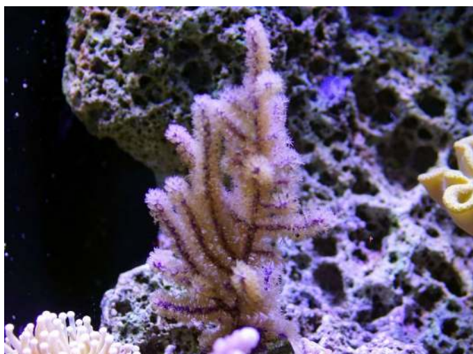
Figure 2. The sea whip Pseudopterogorgia elisabethae (Gorgoniidae)

a novel mechanism that involves prevention of eicosanoid biosynthesis by inhibiting phospholipase A2, 5-lipoxygenase, and cyclooxygenase activity, and by preventing degranulation of leukocytes and the subsequent liberation of lysosomal enzymes [53,56,57]. For these reasons, extracts from P. elisabethae have been incorporated in a line of Estée Lauder cosmetic products for treating skin irritation [58], while particularly pseudopterins A to D are being evaluated for their use as analgesics as well as wound-healing and anti-inflammatory drugs [59-61].