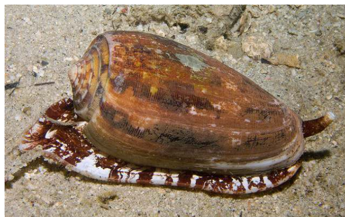
Figure 4. The predatory marine cone snail Conus geographicus (Conidae)

Ziconotide (or SNX-111 or Prialt®) is a synthetic form of a newly described chemical family of short peptides (25 to 30 amino acids in length) called conotoxin peptides [89], and is probably among the most exciting marine natural compounds ever identified. Conotoxin peptides were first extracted from the venom of the predatory cone snails Conus geographicus Linnaeus, 1758, and Conus magus Linnaeus, 1758 (Conidae) (Figure 4) [90]. These snails live in the coral reefs surrounding Australia, Indonesia, and the Philippines, and hunt and kill prey using the powerful neurotoxins in their venom [91]. Each species of cone snail produces its own cocktail of unique venoms containing dozens of nerve toxins, some of which instantly shock the prey while others cause paralysis [91]. Ziconotide was molded on the