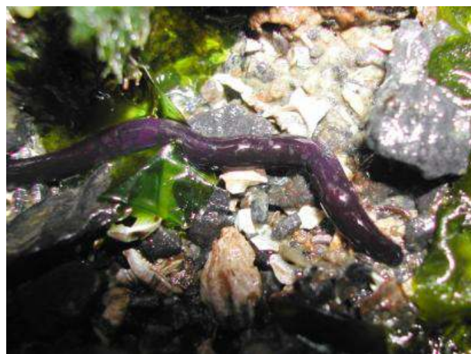
Figure 3. The nemertine worm Paranemertes peregrina (Emplectonematidae)

The linear pentapeptide dolastatin 10 was isolated from the marine sea hare Dolabella auricularia Lightfoot, 1786 (Aplysiidae) which