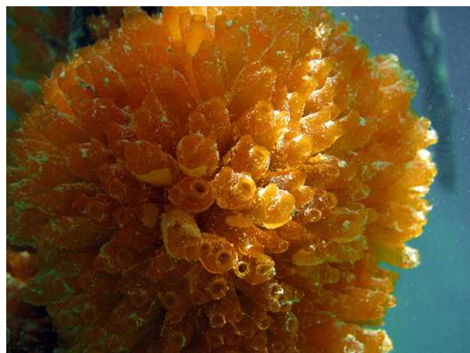
Figure 6. The Caribbean sea squirt Ecteinascidia turbinata (Perophoridae)

Trabectedin also interfered with the mdr1 gene [113] that encodes for the plasma membrane-bound P-glycoprotein which confers multidrug resistance to cancer cells by actively transporting anticancer drugs out of the cells. This suggests a role for trabectedin as a key ingredient in combination chemotherapy regimens to prevent tumor cells from developing resistance to the other drugs. Trabectedin has been granted orphan status against advanced soft tissue sarcomas [114] and is currently undergoing clinical trials for the treatment of various other malignancies [115].