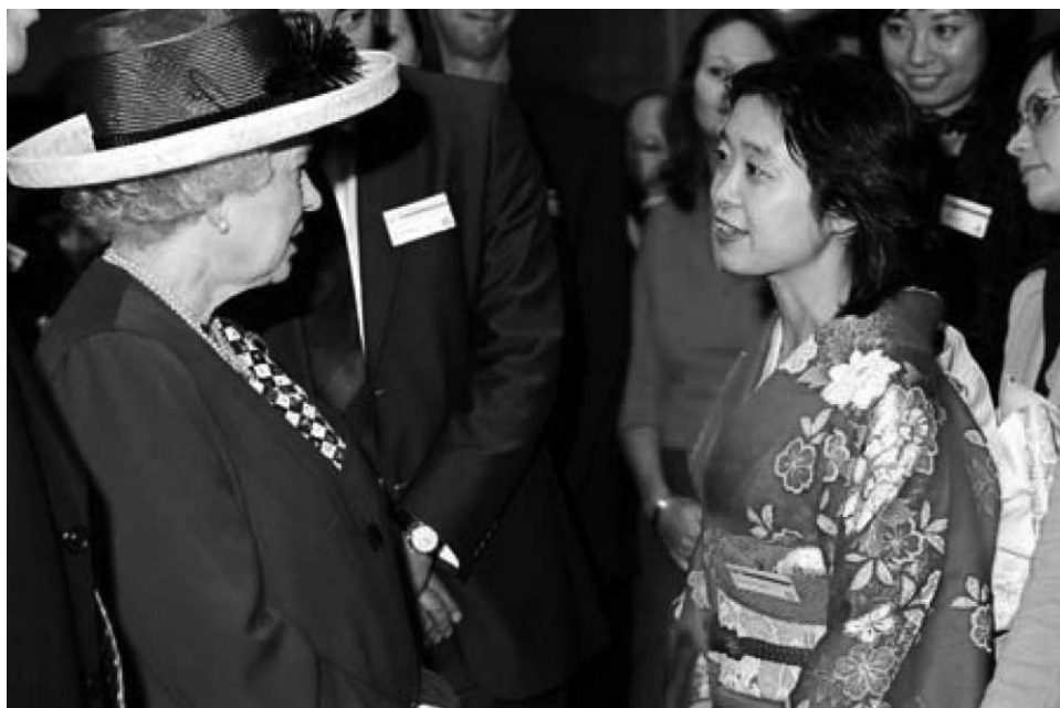
Figure 1. 'The Queen and I': Queen Elizabeth II pictured at the University of Westminster.

At the time, she was working at an English university for a Japanese company that sends students to England. When her university won the Queen's Award for International Enterprise, she was presented to the Queen in traditional, Japanese dress. In the photograph, the Queen has on a striking blue suit and hat, the student has on a beautiful, deep red kimono. They are facing each other, and in that single snapshot they are a vivid portrayal of an encounter between the 'other' (the 'international student') and the ultimate signifier of the former Empire, together celebrating the successes of international trade.