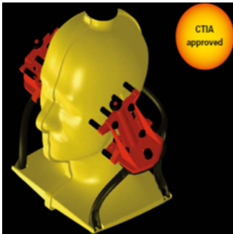
FIGURE 1 SAM Phantom. “CTIA” is Cellular Telecommunications Industry Association.

was a significant ( p < 0.05 ) difference in occurrence of sperm head abnormalities in test animals. The major abnormalities observed were knobbed hook, pin-head and banana shaped sperm head. The occurrence of the sperm head abnormalities was also found to be dose dependent” (Otitolaju et al., 2010). The researchers reported sperm abnormalities at 489 mV/m (workplace), and 646 mV/m (residential) compared to exposure limits of 41,000 mV/m and 58,000 mV/m, respectively (ICNIRP, 1998).