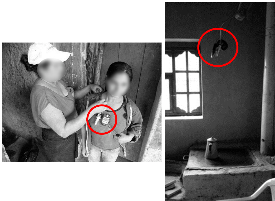
Figure 2. Example placement for kitchen exposure measurements (left) and personal measurements (right).