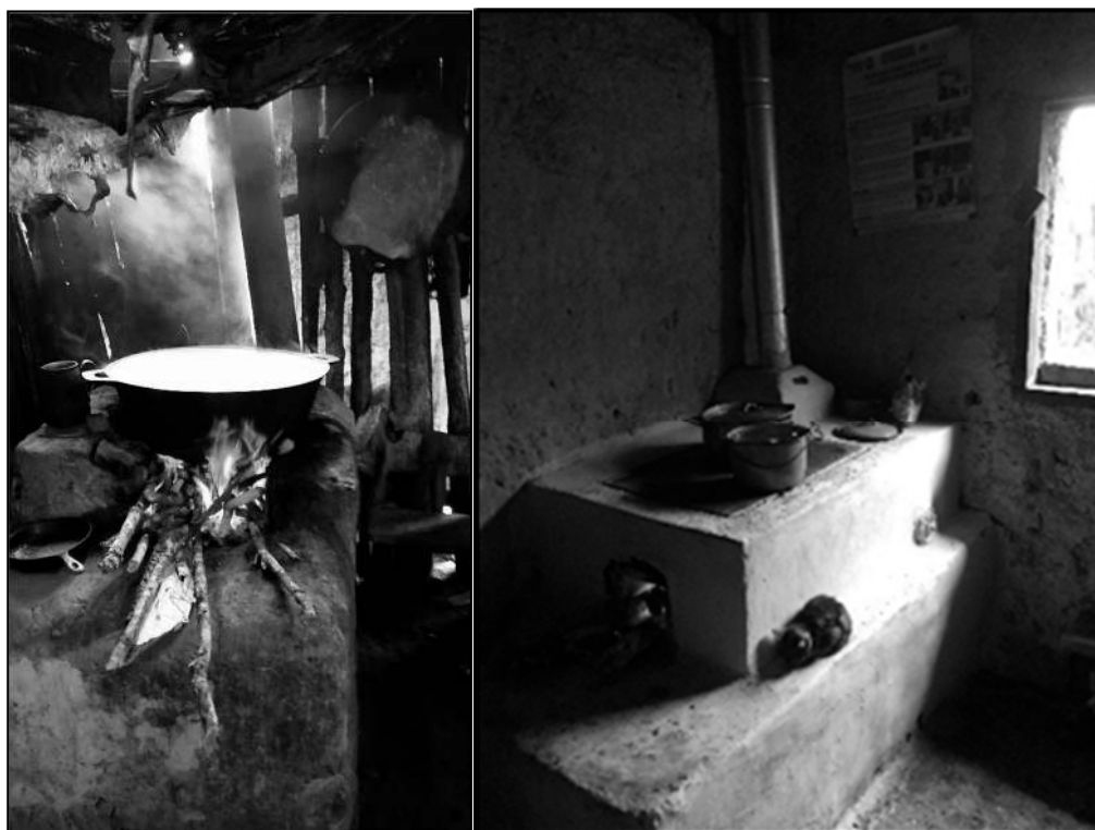
Figure 1. Typical traditional (left) and Justa (right) cookstoves in the homes of Honduran women.

The cleaner-burning Justa stove is a common wood-burning cleaner-burning stove in Latin America with a rocket-elbow combustion chamber, chimney, and metal griddle suited to making tortillas.