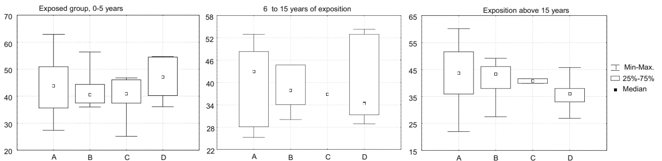
Fig. 2 DNA fragmentation in relation to exposure time period in the exposed group subdivided according to job titles: a nurse; b anaesthesiologist and surgeon; c medical aid; d scrub nurse

A question of occupational safety in the operation theatre still remains open. A step forward was made when the admitted occupational doses were established by the National Institute for Occupational Safety and Health (USA) for N 2 O and halogenated anaesthetics at 25 ppm and 2 ppm, respectively. Other countries introduced their own regulations concerning concentration (Scapellato et al. 2008) and methodology recommended to estimate the risk factors (Kucharska and Wesołowski 2014). A list of threshold values introduced in the USA and some European countries can be found in a review paper by Byhahn et al. (2001).