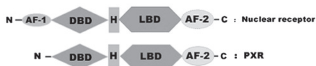
Figure 1. Schematic comparison of the domain structures of a typical nuclear receptor and PXR. AF-1, activation function-1; DBD, DNA-binding domain; H, hinge region; LBD, ligand-binding domain; AF-2, transactivation function-2; PXR, pregnane X receptor.

Distribution of PXR. The expression of PXR is widespread in the tissues of humans and rodents. PXR is highly expressed in the liver, small intestine and colon in humans, rabbits, rats and mice (1-4,27-30). Notably, these are also the same tissues where the CYP3A genes are most highly induced and expressed. In rodents, PXR mRNA has been detected in the kidney (31), brain (32), lung (33) stomach, ovary, placenta (34,35), immune cells (36), peripheral mononuclear blood cells (37,38), heart, bone marrow and spinal cord (39). PXR is expressed not only