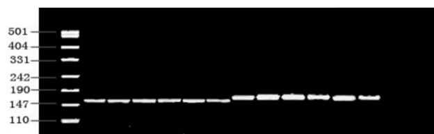
Fig. 2. PCR amplification of BAX and GAPDH.