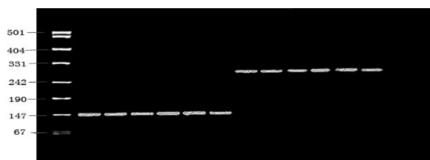
Fig. 1. PCR amplification of ZFX and Bcl-2.

and 171 bp products (Figs. 1, 2), respectively. According to the results of the gel imaging system, primers had excellent specificity and the qualities of the templates were reliable.