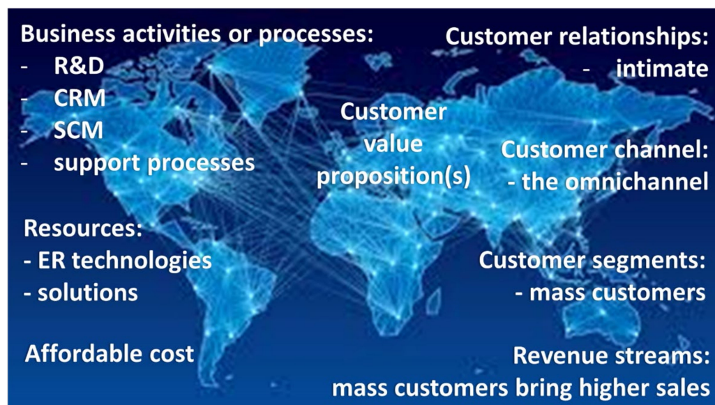
Figure 3. ER enables customer pull in delivery models and business models.

It is not just the delivery model that is digitally transformed by ER. The other elements of the business model, business activities, business resources, and business partners, will be transformed as well. The empirical data are rich, showing numerous use cases that may be functionally specific or may overarch all functional activities. These use cases are elaborate and may refer to enterprise architecture in all at Microsoft, Oracle, SAP, AWS, and IBM. The delivery model may be complemented by activities and resources that shape business models. Preconfigured products are the reference business model for the digital enterprise, which match a global value chain as shown in Figure 2, where customer relationship management processes globally initiate supply chain management. This is a platform business model, where the customer order dictates operations across the world. Another platform business model is based on the customer value proposition bespoke products, on mass customer segments reached via electronic commerce, and on customer cocreation. Business processes are initiated by the customer order via digital marketing and sent to cyber-physical systems directing additive manufacturing at PTC, Siemens, Software AG, and Oracle.