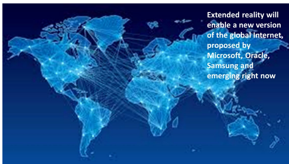
Figure 1. Major vendor reports foresee ER will shape a new form of Internet interface to customers and employees, emerging late 2021.