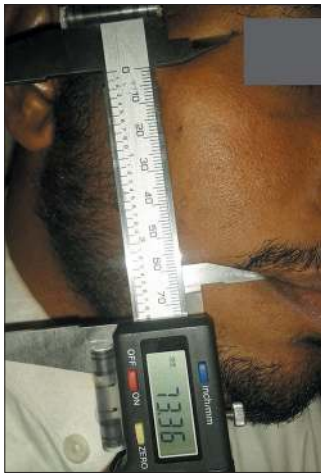
Figure 4: Measurement of the distance from outer canthus of the eye to rima oris