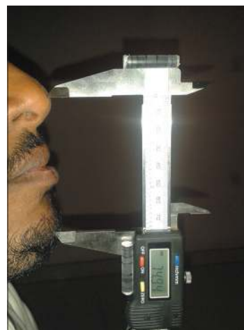
Figure 1: Measurement of the distance from tip of the nose to tip of the chin

Sixteen subjects were randomly selected for test-retest method of reliability. The measurements were made twice on the same participants by one author with an interval of 2 weeks in between. Data were entered and