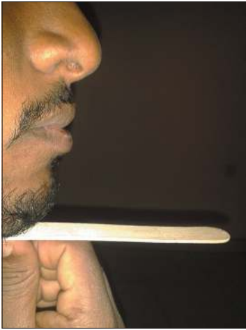
Figure 2: Parallelism for measurement