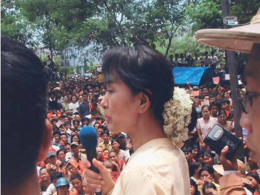
Aung San Suu Kyi in crowd after her release (2002) (Mandalay)