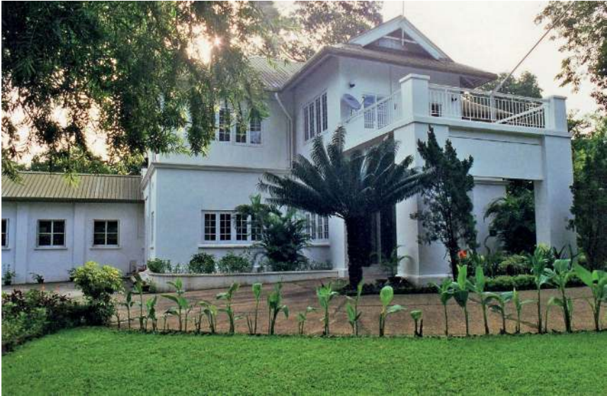
Australian Ambassador's residence and garden, Yangon (2002)