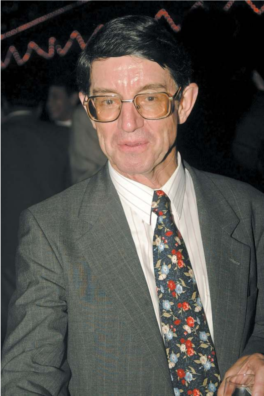
At an Australia Day Reception at the Australian Club, Yangon (2003)