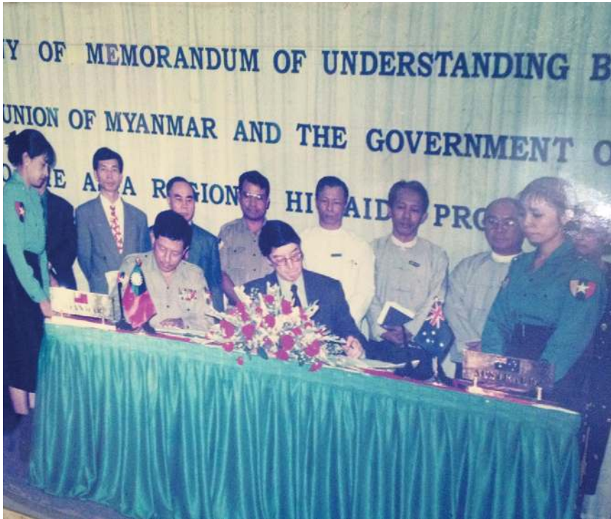
Signing MOU on HIV AIDS cooperation with Myanmar Police Force (2002)