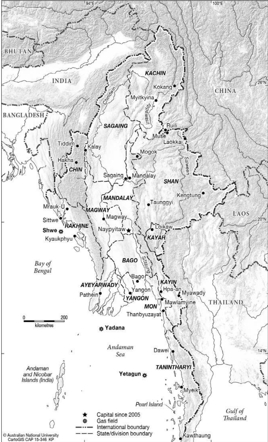
Map of Myanmar/Burma