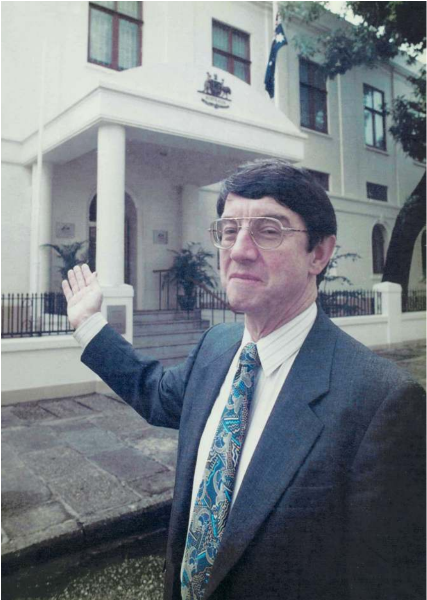
At opening of the refurbished Australian Embassy, Strand Road (2000)