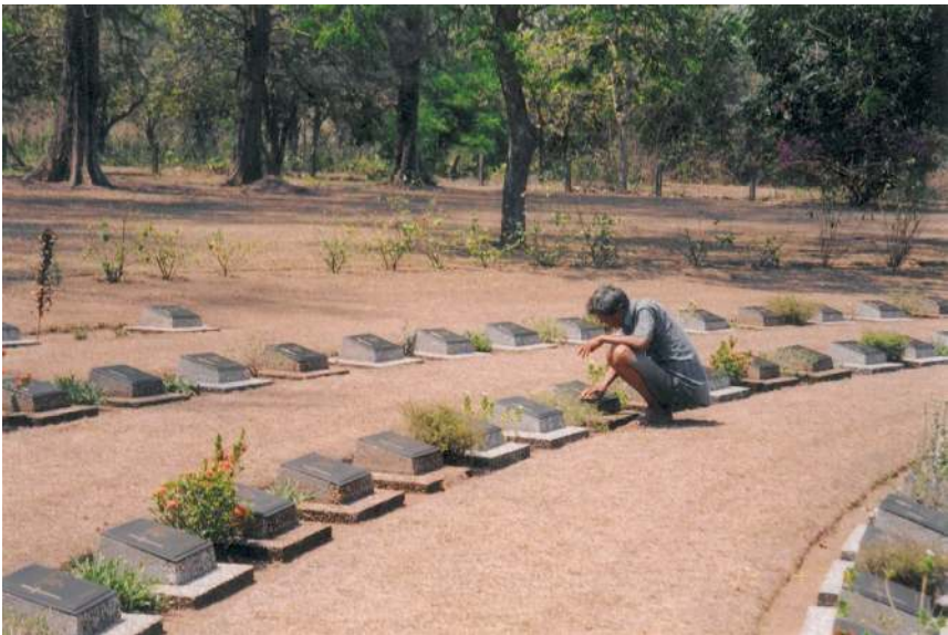
Thanbyuzayat War Cemetery gravestones (2002)