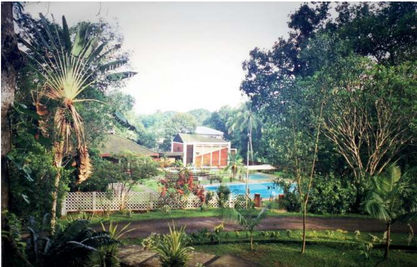
Australian Club buildings taken from Ambassadors' residence (2002)