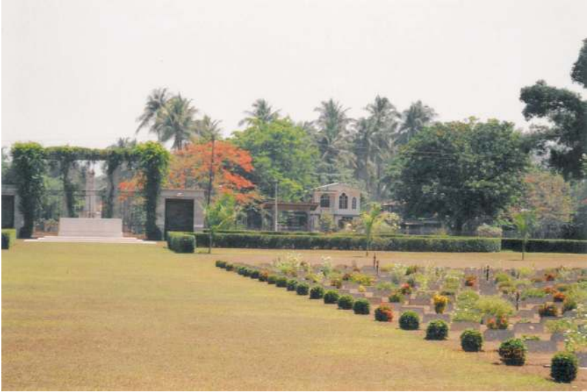
Thanbyuzayat Commonwealth War Cemetery – Entrance gate and gravestones