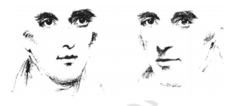
Figure 1. FIA and intrinsic relationship of face analysis tasks [46].

The intrinsic relation between various face parts is also confirmed in the latest research work reported in [48–52]. Research reported in [49–52] suggests that a mutual relationship between different face parts can be exploited to address several tasks in a single framework. The research work proposed in [53] segments a face image into six different face parts, which are later used for HPE in [49,50]. Similarly, gender recognition is combined with other tasks using the same strategy in [52]. A single framework is proposed in later research [51], combining gender recognition, race classification, HPE, and facial expression recognition. In short, CV researchers and psychology literature strongly suggest that face analysis tasks can be addressed in a better way if combined in a single unified framework. This paper aims to present the reader with a single review article where different methods are reported combining several face analysis tasks into one model.