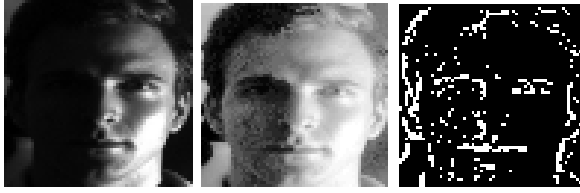
Fig. 3. Simple histogram equalization (middle) and the respective DoG filter response (far right) of the input image on the left.