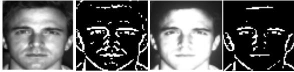
Fig. 1. A DoG filtering example. The original image (far left), its DoG, the recaptured image (third column) and its DoG (far right). Notice that the first DoG has more details than the second one.

In this paper, we explore such information in order to detect whether an image is a spoof or not. For that, we analyze the image similar to [2], using a Difference of Gaussian (DoG) filter, which is a bandpass filter that uses two Gaussian filters with different standard deviations as limits. The idea is to keep the high-middle-frequencies to detect the borders, but not much, in order to remove the noise (which is also a high-frequency). Figure 1 depicts an image that passes through this filter. In this work, we used the same standard deviations, \sigma_1 = 0.5 and \sigma_2 = 1.0 proposed by Tan et al. [2].