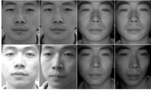
Fig. 1. Face image examples. Row 1: VIS face images (two on the left) taken on enrollment with frontal lighting and pose, and two NIR face images (two on the right) taken at the same time. Row 2: Two VIS image (left) and two NIR face images taken on authentication with lighting and pose variations.

where \rho(x, y) is the albedo at point (x, y) , \mathbf{n} = (n_x, n_y, n_z) is the surface normal (a unit row vector) in the 3D space, and \mathbf{s} = (s_x, s_y, s_z)^T is the lighting direction (a column vector, with magnitude). The albedo \rho(x, y) function reflects the photometric properties, such as facial skin and hairs, and \mathbf{n}(x, y) is the geometric shape (2.5 map) of the surface.