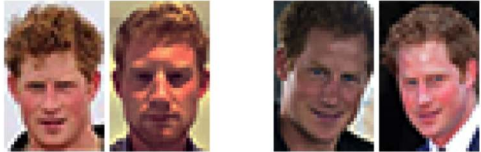
Fig 3. Example trials from the PLT. Images on the left show different identities (with the imposter face on the right). Images on the right show the same identity.