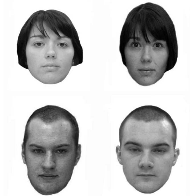
Fig 1. Example trials from the Glasgow Face Matching Test (GFMT). The top pair shows two instances of the same person, the bottom pair shows two different people. The individuals shown in Fig 1 have given written informed consent (as outlined in PLOS consent form) to publish these images.

We carried out three tests of face recognition. 1) The Glasgow Face Matching Test (GFMT) [26] , which is a standardised test of unfamiliar face matching; 2) an unfamiliar face matching test that was designed to be particularly difficult, the Models Face Matching Test (MFMT) [27] ; and 3) the Pixelated Lookalikes Test (PLT)—a new test of familiar face recognition based on very poor quality images.