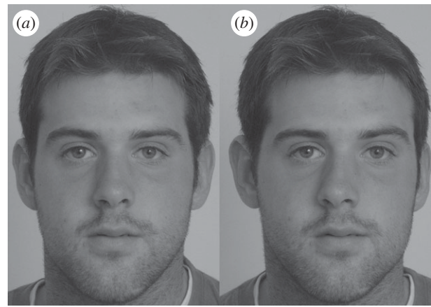
Figure 1. Symmetry and asymmetry. (a) A shape-symmetric facial composite and (b) asymmetric version. Features and outline are marked on the faces in order to create symmetric/asymmetric versions. The asymmetric version has had its asymmetry enhanced by 50%. Symmetric images are usually preferred to asymmetric images.

Importantly, recent studies have implicated perceptions of health in attraction to symmetric faces [44,53]