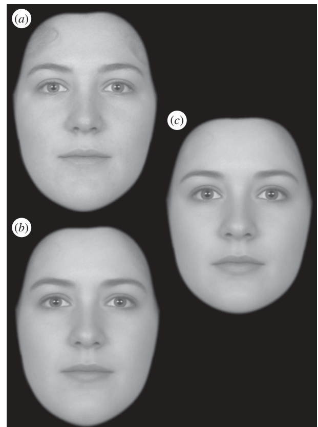
Figure 2. Averageness. (a) A composite image made from three images, (b) the same image given the colour of nine images and (c) a shape and colour composite made from nine images. Image (c) should be more attractive than both of the other images. Composites are made by marking key locations around the main facial features (e.g. points outline the eyes, nose and mouth) and the outline of each face (e.g. jaw line, hair line). The average location of each point of the component faces is then calculated to define the shape of the composite. The images of the individual faces are then warped to the relevant average shape before superimposing the images to produce a photographic quality composite image.

From an evolutionary view, extremes of secondary sexual characteristics (more feminine for women, more masculine for men) are proposed to be attractive because they advertise the quality of an individual in terms of heritable benefits; they indicate that the