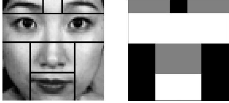
Fig. 3. (a) An example of facial expression image divided into eight regions; (b) The weights set for different regions: black regions indicate weight 1.00, gray regions 2.00, and white regions 4.00.

where q is a continuous parameter, m denotes the maximum number of histogram bins, and h_i is the value of histogram entry i . The physical meaning of Tsallis entropy [8] is that it reflects the distribution characteristics of a histogram. Therefore, it can capture more detailed information with respect to the histogram distribution than the average magnitude response (i.e., mean value of the histogram) which was adopted by most traditional methods.