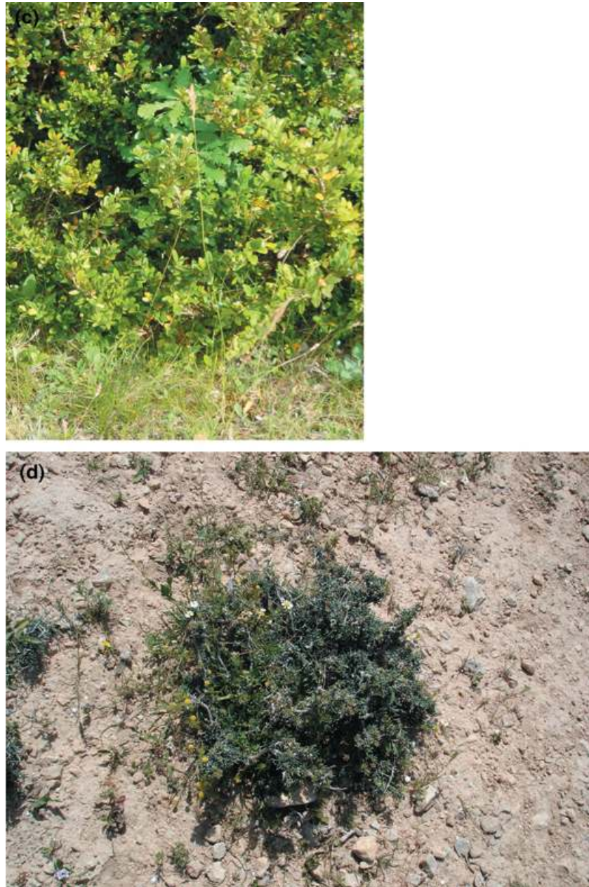
Fig. 1. continued

negative effects of desert shrubs on annual species with increasing water availability. In contrast, but in a study conducted on only one species pair, Maestre & Cortina (2004) found a switch from competition to facilitation and back to competition along a gradient of decreasing rainfall in a semi-arid steppe system. Similarly, Tielbörger & Kadmon (2000a) found that the effect of desert shrubs on annuals shifted from negative to neutral or neutral to positive (depending on the species) with increasing annual rainfall. Pennings et al. (2003) failed to find support for predictions from the SGH in a study conducted over a large-scale geographical gradient in salt marshes.