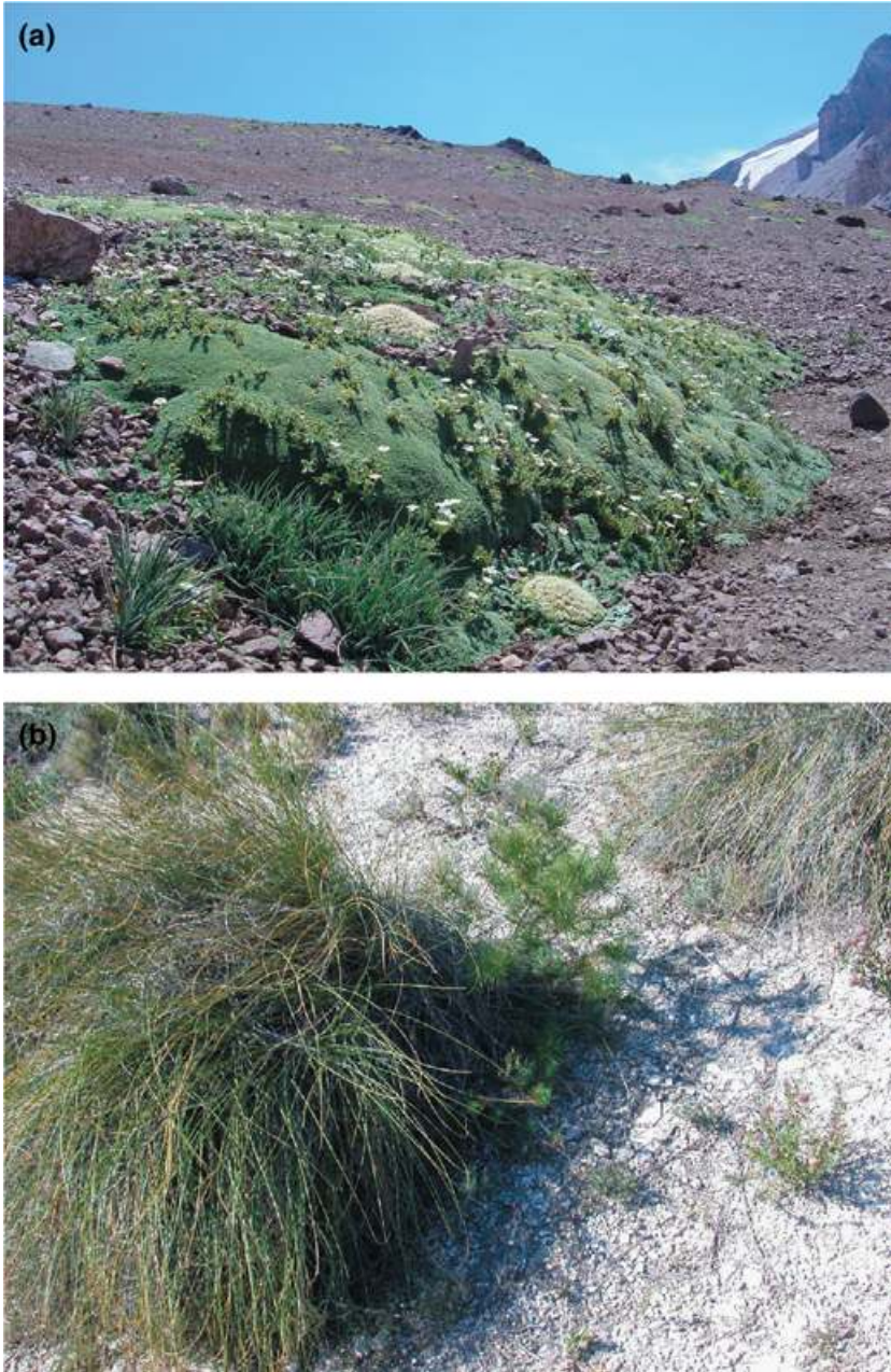
Fig. 1. Examples of mechanisms of plant-plant facilitation. (a) Buffered substrate and air temperature, enhanced soil moisture and nutrient content. Cushion of Azorella monantha harbouring native and invasive species (e.g. the Andean cauliflower Nastanthus agglomeratus and the field chickweed Cerastium arvense , respectively) at the upper limit of vegetation (3600 m a.s.l) in the high Andes of central Chile. (see Cavieres et al. 2005, 2007). (b) Protection from drought. Adult individual of the tussock grass Stipa tenacissima facilitating a sapling of Pinus halepensis in a semi-arid steppe, south-east Spain. (see Maestre et al. 2001, 2003a). (c) Protection from browsing. Quercus pubescens seedling within unpalatable Buxus sempervirens shrubs, southern France. (see Kunstler et al. 2006). (d) Protection from browsing and drought. Facilitation by Gymnocarpus decander of annual vegetation in a semi-arid environment, Jordan.

debate concerning gradients of stress (Tilman 1988; Grace 1991, 1993; Reader et al. 1994; Brooker et al. 2005), although their approach was not without criticism (Bertness 1998).