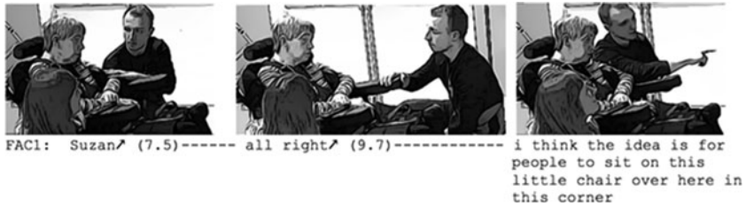
Figure 2. Stills from the video at lines 73–8.

for a conditionally relevant next. Where a person is not capable of providing responses, as in the case featured here in our data, speakers adapt their responses to the lack of displayed uptake from their interlocutors. We will turn to this now.