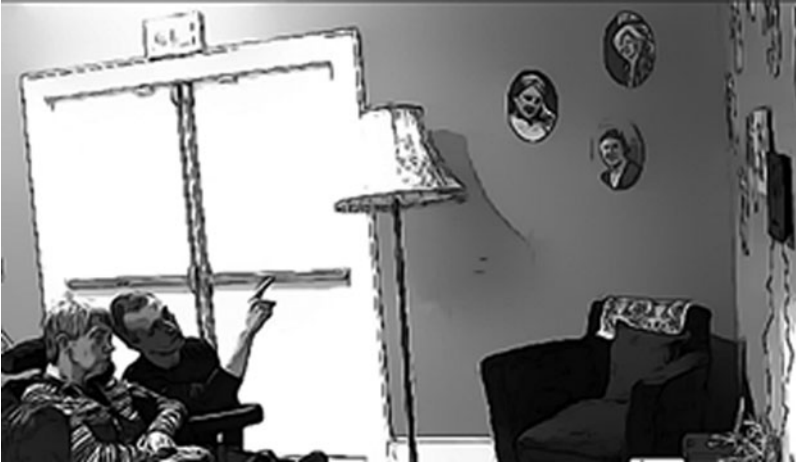
Figure 1. Exhibit and orientation of the viewers.