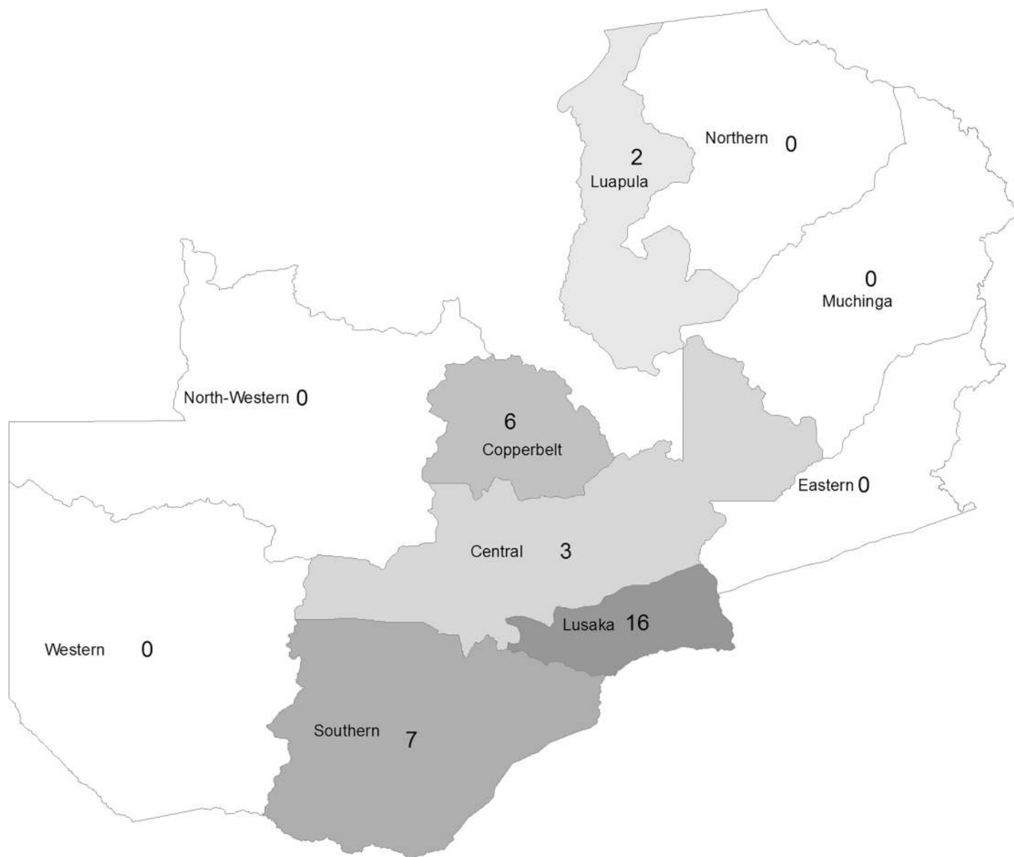
Fig 2. Research conducted in Zambian provinces.

https://doi.org/10.1371/journal.pone.0192327.g002