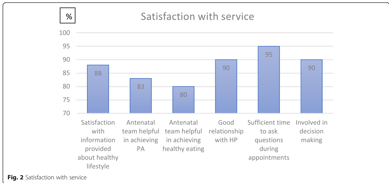
Fig. 2 Satisfaction with service

maintaining changes to physical activity, whilst 28 (74%) were confident they could maintain lifestyle changes post-partum.