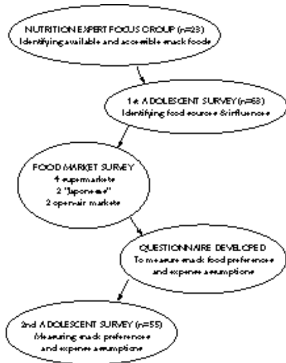
Figure 1 - Study procedures.

toward and the influence of family and friends on healthy (high-nutrient density) snack choices. Figure 1 illustrates the study procedures. The results of the nutrition expert focus group and the food market source comparisons are described in the methods section as part of an explanation of the research process. Findings derived from the adolescent food sources and influences survey (N=63) and snack preferences and expense assumptions survey (N=55) are described within the results section.