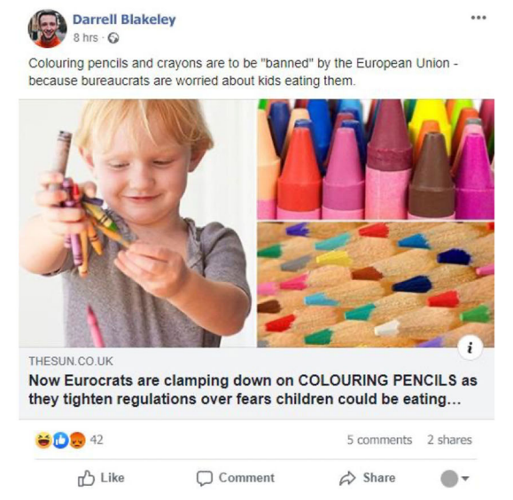
Fig. 1 Real news (left image) and fake news (right image) article shared as a Facebook post by an unknown individual