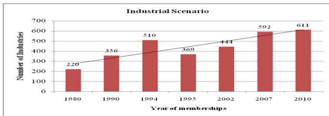
Fig. 1. Industrial Spectrum at Vitthal Udyognagar Industrial estate

Rotated Matrix: There are various methods of rotations. The method of rotation used is varimax, which is the most commonly used rotation method in factor analysis. The variance explained by each component after the varimax rotation method and the number of factors extracted based on Eigen value 1 and more, total variance explained is 64.0130%, the variables associated with four factors are grouped (see appendices, table 6).