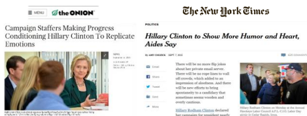
Figure 2: Two news articles about Hillary Clinton: from the Onion and The New York Times.

gerous and invasive' Khapra beetle intercepted at Pearson". See Figure 2 for the pairing of the articles about Hillary Clinton in the Elections topic.