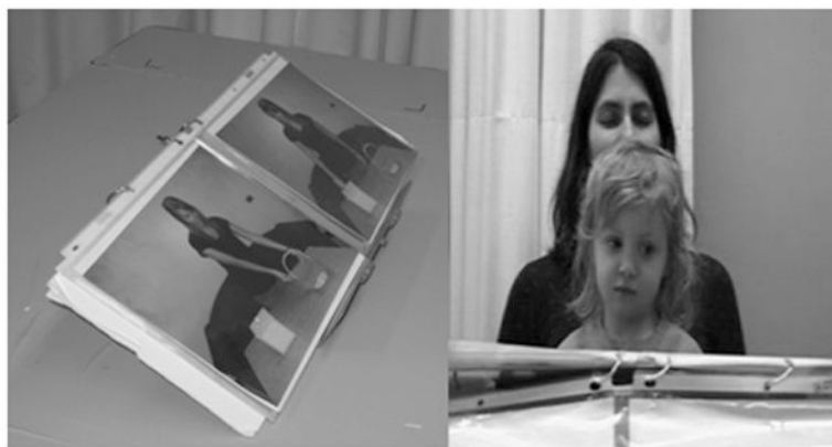
Figure 1. Picture book used in Experiment 1 (left) and a child participating in the task (right).