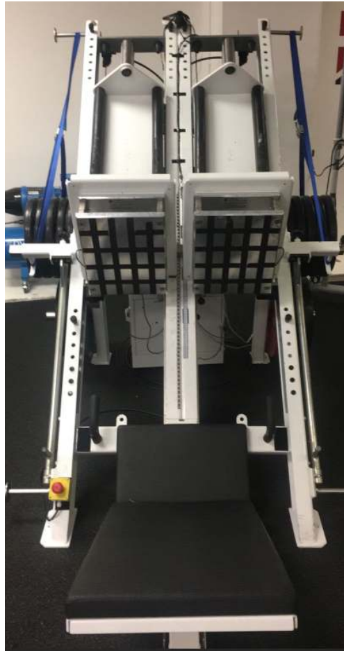
Figure 1. The experimental set-up. An example of the position required for the ISO 120 test (Panel A) and the isometric leg press device with the carriage secured with ratchet straps (Panel B).