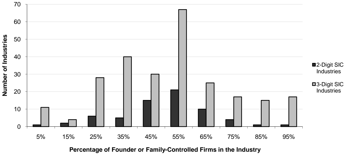
Figure 1. Distribution of Family Control across Industries

Founder or family-controlled firms are defined as those in which the founder or a member of the founder’s family by either blood or marriage is an officer, director, or blockholder, either individually or as a group. The sample comprises the 8,104 publicly traded U.S. firms in year 2000 that have segment data. These firms have 11,854 segments in 254 three-digit industries, or 11,008 unique two-digit segments in the 66 two-digit industries listed in the table. Family control of industries is measured using a random subsample of 2,110 firms for which we collect ownership data. These firms have 3,968 segments representing an average of 39% of all firms (and a minimum of 20%) in each of the 254 three-digit industries, and 3,511 unique two-digit segments representing an average of 40% (and a minimum of 25%) of all firms in each of the 66 two-digit industries in the full sample.