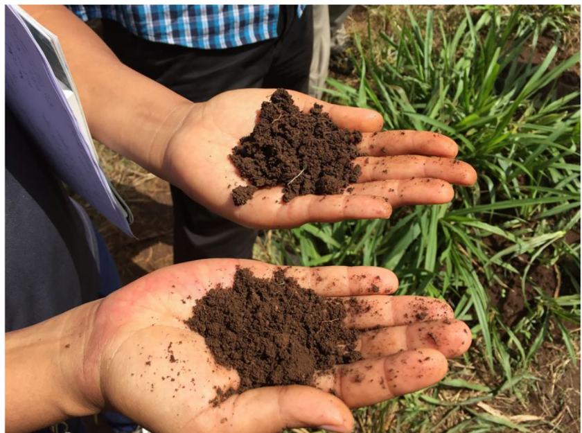
Fig. 2 Conservation Agriculture managed soil in top hand in photo, conventional tillage soil in bottom hand. Fields were side-by-side, separated by a narrow walking path. Soils were picked up by reaching into the field while standing on the path (approximately 2m from each other). Photo credit: Marla Riekman, 2018 Muranga county, Kenya.

Our work built on the participatory action research model but stressed indigenous farmer knowledge in the assessment of CA practices. Consulting with farmers during the soil assessment makes them active participants in the research and provides a link between scientific and on-farm knowledge (Adeyolanu and Ogunkunle 2016). However, engaging farmers as research partners requires certain considerations. One involves the validation of farmer knowledge. The effectiveness with which both local and scientific knowledge was