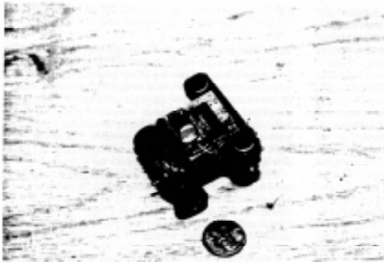
Fig. 4 Squirt, the smallest robot we have built to date, packs motor, batteries, microcomputer, interface electronics and three sensors into a volume slightly larger than one cubic inch.

Not all of the small rovers need be alike. Different ones could be specialised to particular scientific goals by the selection of (small) instruments onboard. The overall science component of the mission need not be compromised if time is spent rethinking the size and type of instruments used. The possibilities arising from having multiple well separated rovers which can nevertheless communicate with each other might lead to new and better measurement techniques on some fields.