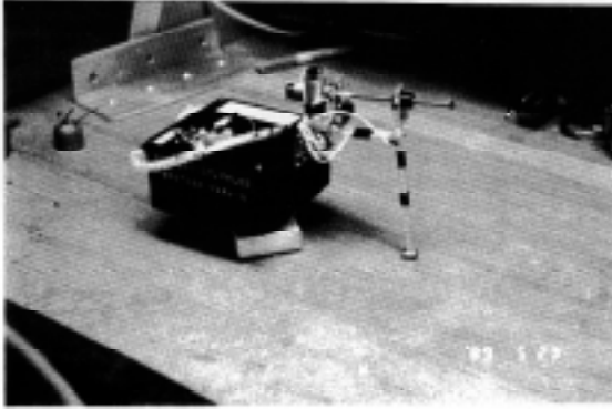
Fig. 3 A three-axis force controlled leg is the basis for a new six-legged rover. Each leg will have its own microprocessor for force servoing. Microprocessors will be connected together in a ring network. Total weight for the six legged walker will be 1.3 Kg. including batteries and solar cells for recharging. On Earth the robot will have a 10% working duty cycle during the day.