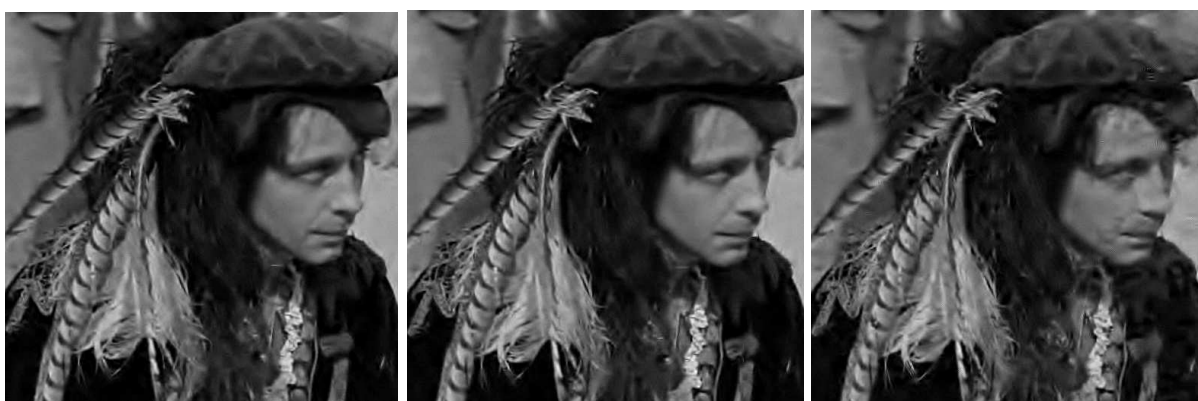
Fig. 3. Portions of reconstructed 1024 \times 1024 image Man using iterative thresholding. Left: SFE with ideal random permutation, PSNR=27.6dB; Middle: SBHE with B = 32 and LCP scrambler, PSNR=27.8dB; SBHE B = 32 and RPRI crambler: PSNR=26.5dB.