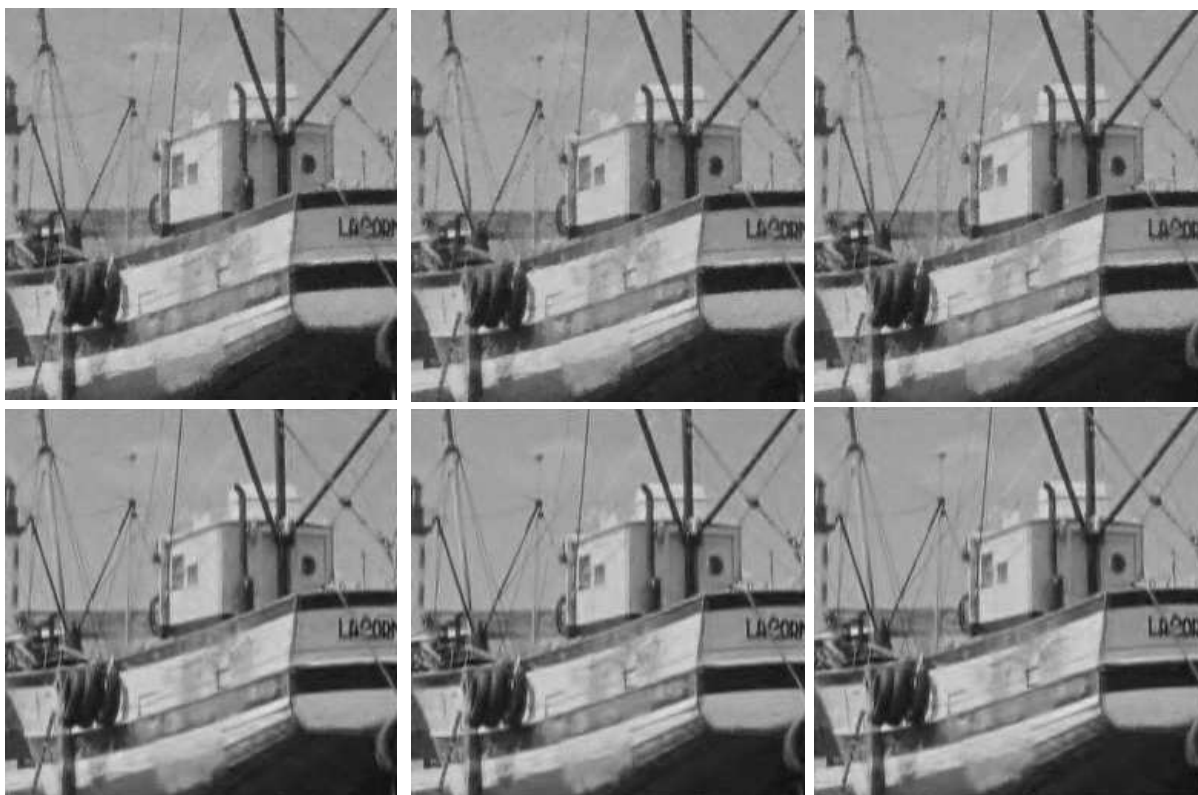
Fig. 2. Reconstructed 256 \times 256 Boats with M = 20,000 samples. First row: min-TV reconstruction [11]. Second Row: Iterative thresholding reconstruction [14]. In each row, left: results of the dense SFE and ideal random permutation; middle: results of the SBHE with B = 32 and an LCP scrambler; right: results of the SBHE with B = 32 and an RPRI scrambler;